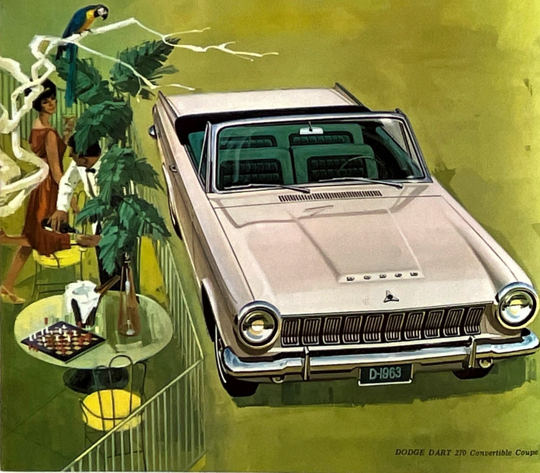
DODGE DART 270 Convertible Coupe

On the 4-Door Sedan illustration, note the smart, new design of the rear end of the car. The wide, slightly-curved, recessed rear window; the sculptured ridges on the top of the rear fenders that flow into the upper structure and across the roof; the wide gently-sloping rear deck; and the canted, circular tail lamps, are all new design