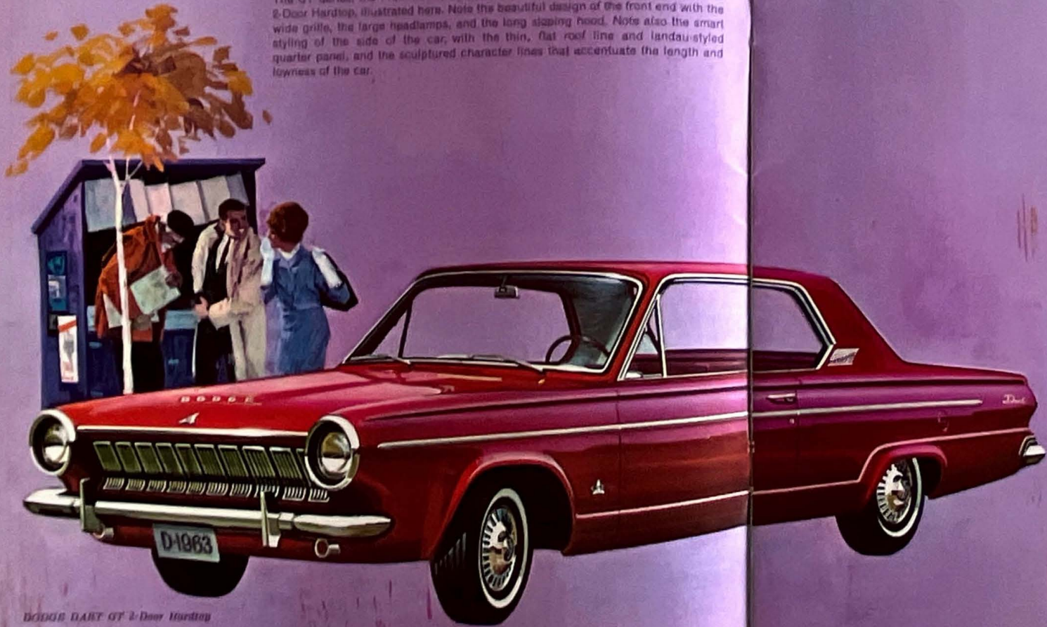
DODGE DART GT 2-Door Hardtop

The GT Series, the Premium Sport Line, includes the Convertible Coupe and the 2-Door Hardtop, illustrated here. Note the beautiful design of the front end with the wide grille, the large headlamps, and the long sloping hood. Note also the smart styling of the side of the car, with the thin, flat roof line and landau-styled quarter panel, and the sculptured character lines that accentuate the length and lowness of the car.