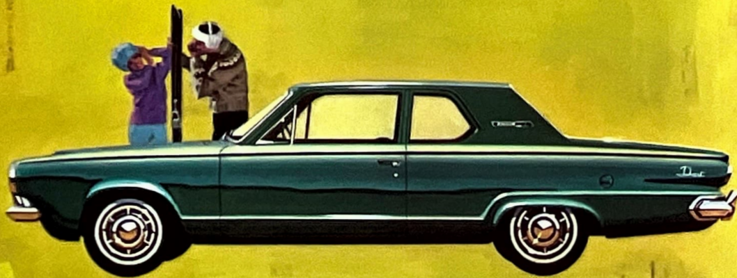
DODGE DART 170 2-Door Sedan

The Dart Line is not only the newest dimension from Dodge, but also one of the finest engineered and quality built cars. It has many engineering features that give it exceptionally fine performance, dependability, and economy. Its all-welded Uni-body construction is the strongest built. Its Torsion-Aire suspension is one of its