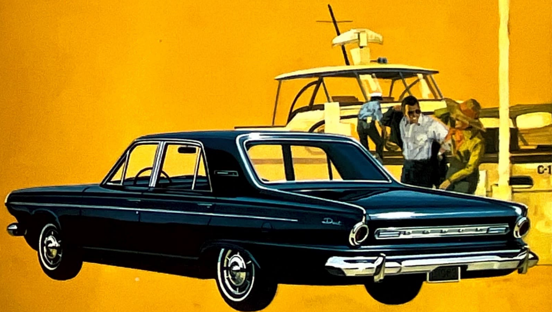
DODGE DART 270 4-Door Sedan

Each of the Series has distinctive ornamentation and nameplates. Each has different high quality fabrics, and individual styling design of the interiors. The seats, side panels, headlining, and floor covering are color-keyed. There are four upholstery colors – Blue – Tan – Red – and Turquoise. And there are twelve smart, new, exterior colors – Onyx, Light Blue, Medium Blue, Dark Blue, Aqua, Ivory, Steel Grey, Vermillion, Turquoise, Polar, Beige and Sandalwood.