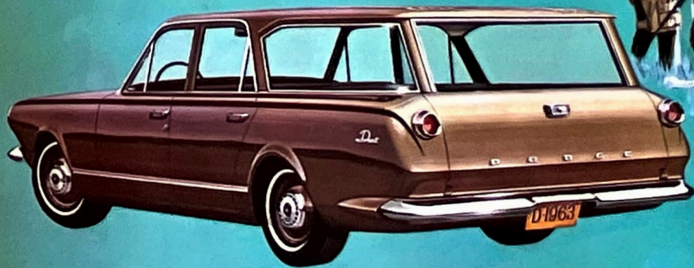
DODGE DART 170 4-Door Station Wagon - 6 Passengers

greatest features. The Economy Slant-Six is one of the finest 6-cylinder engines ever produced. The baked-enamel exterior finish will hold its lustre for years. The exclusive Chrysler Corporation Alternator keeps your battery charged even while idling. And the Servo-Contact brakes are unexcelled in the industry. The 1963 Dart has many engineering improvements and refinements. It has a closed crankcase ventilation system which insures a cleaner engine. It has an improved starter for faster cold weather starting. It has a new, hand operated parking brake. And many other features which a demonstration will bring out - contact your dealer to drive this great new Dart yourself.